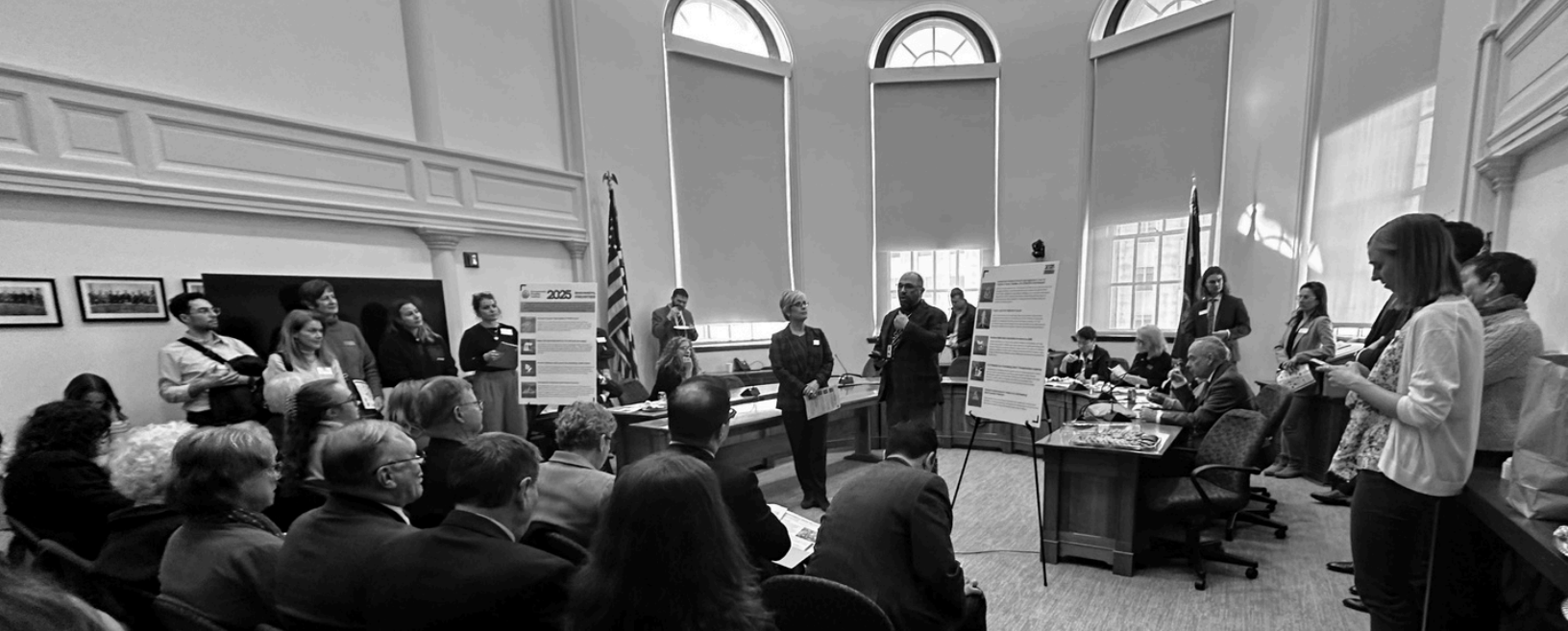
Environmental Priorities Coalition Launch Event at the Legislature